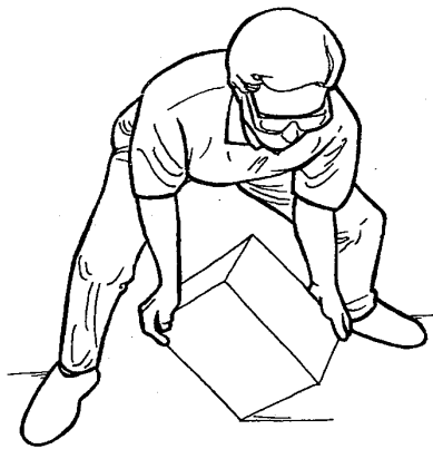
Tip the Load on a load with no handles