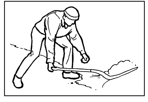
2-Push down of the handle so the shovel holds the snow.