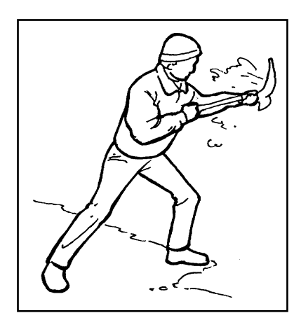
5-Throw the snow with your legs and spray the shovel with Pam so it is slipperier.