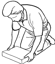
This is nothing but a back lift