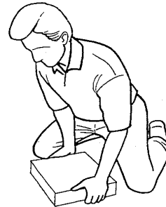
Create a wide stance by separating your knees