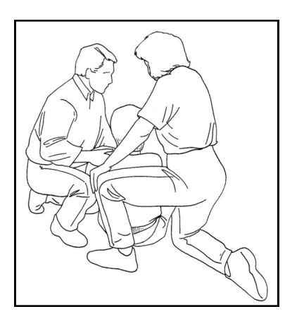
2 – As you sit the patient up swing one of your legs behind to support his back to keep him in a sitting posi-