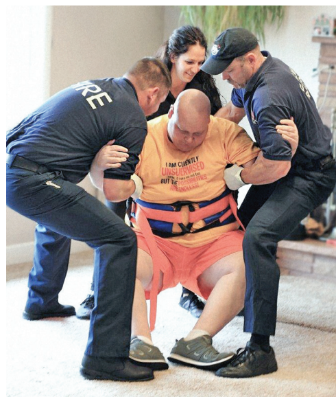
Easily lift with up to 5 people